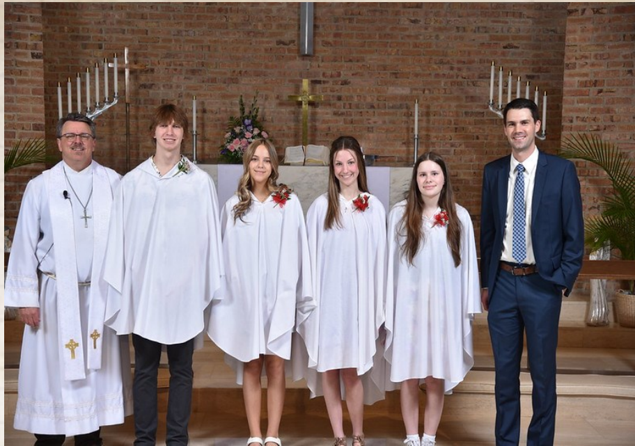
Congratulations Confirmands! May 5, 2024