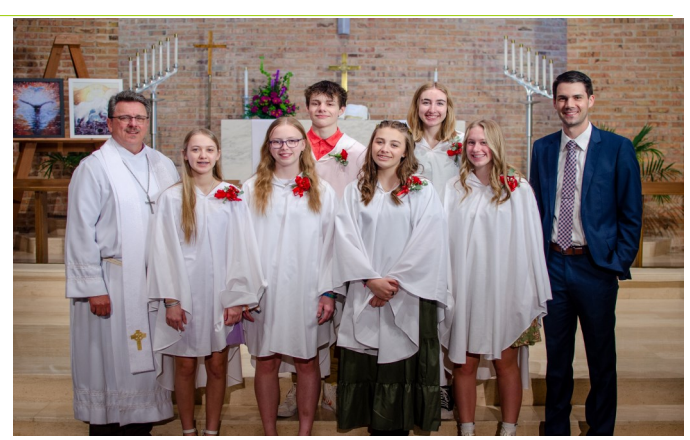
GOD BLESS ZION'S

There will be departures from Sioux Falls ($4,776) and Minneapolis ($4,576). You may register online at: RegisterNow.ittworld.com and use the Tour Code: WMeyer24. If interested, contact the church office for a brochure. You may also contact Rev. Meyer at (320-760-7005).